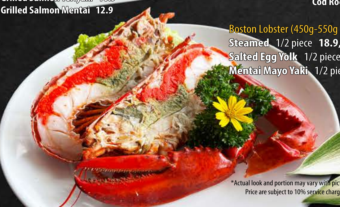
Boston Lobster (450g-550g per piece) Steamed 1/2 piece 18.9, per piece 34.9 Salted Egg Yolk 1/2 piece 20.9, per piece 38.9 Mentai Mayo Yaki 1/2 piece 20.9, per piece 38.9