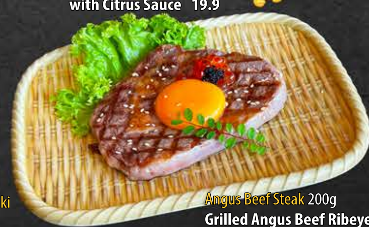
Angus Beef Steak 200g Grilled Angus Beef Ribeye steak with Egg Yolk 25.9