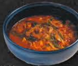
Yukkejyan Soup Beef, Vegetables & Egg with Spicy Miso Soup 6.9