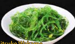
Ajitsuke Wakame Seasoned Seaweed 3.9