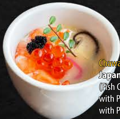
Chawanmushi Japanese Steamed Egg 2.9 (Fish Cake, Chicken, Crab Stick, Shitake) with Prawn & Tobikko 4.9 with Prawn, Tobikko & Ikura 5.9