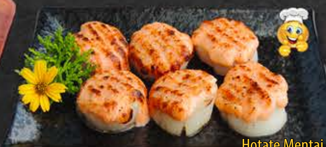
Hotate Mentai Mayo Yaki Grilled Scallop with Cod Roe Mayonnaise 3 pcs 14.9/ 5 pcs 23.9