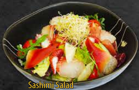
Sashimi Salad Mixed Salad with Assorted Sashimi 16.9