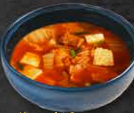
Kimuchi Soup Kimuchi Soup with pork & Tofu 5.9