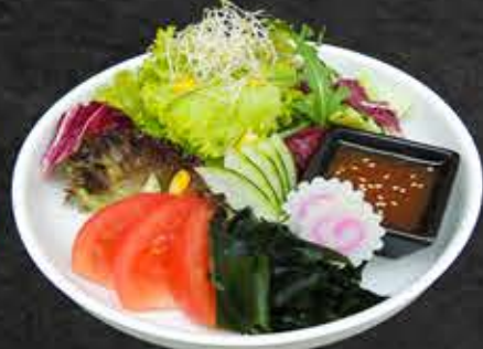
Wakame Salad Seaweed Salad 7.9