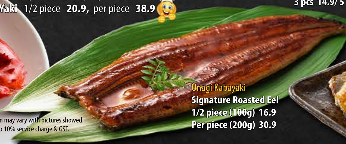
Unagi Kabayaki Signature Roasted Eel 1/2 piece (100g) 16.9 Per piece (200g) 30.9