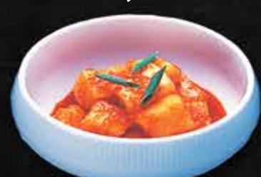
Kakuteki Raddish Pickle 3.9