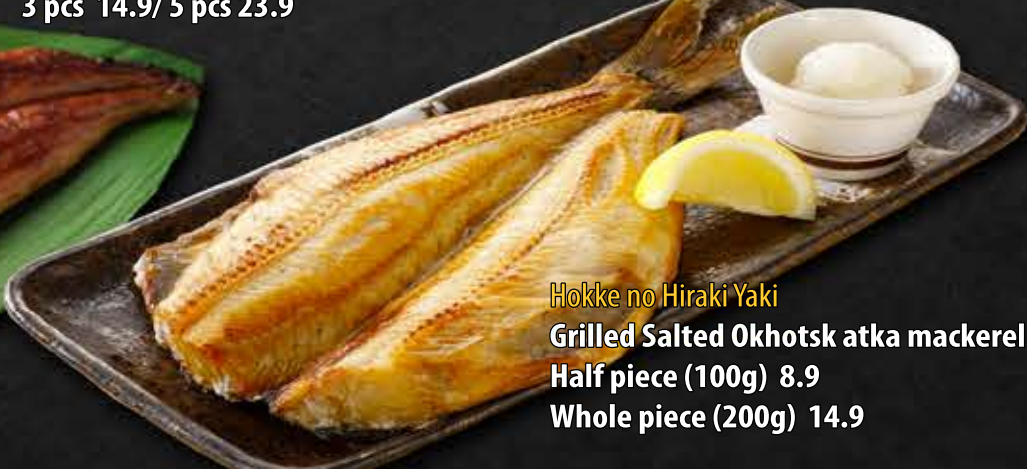
Hokke no Hiraki Yaki Grilled Salted Okhotsk atka mackerel Half piece (100g) 8.9 Whole piece (200g) 14.9