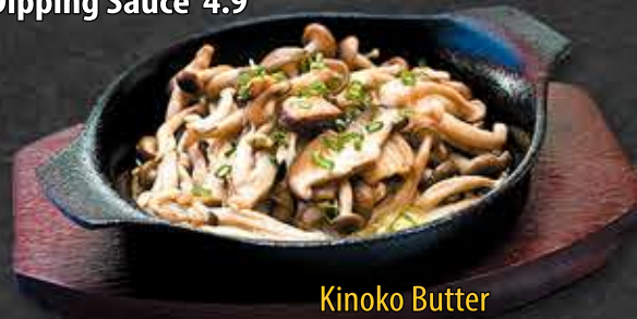
Kinoko Butter Assorted Mushroom with Butter 12.9