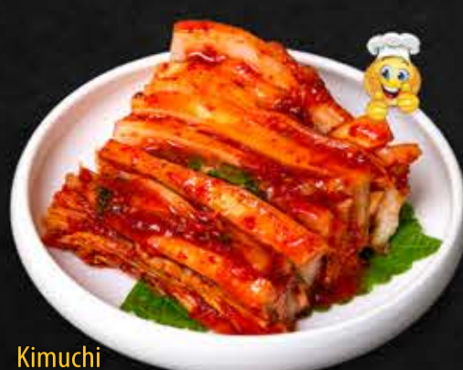
Kimuchi Napa Cabbage Pickle 3.9