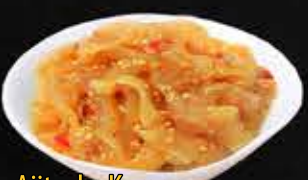
Ajitsuke Kurage Seasoned Jelly Fish 3.9