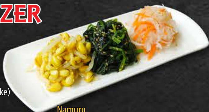
Namuru Marinated Bean Sprout, Spinach and Radish 6.9