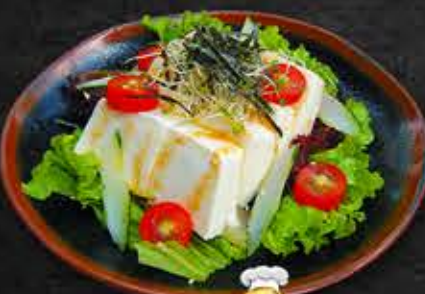
Tofu Salad Bean Curd Salad 7.9