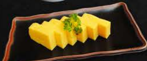
Atsuyaki Tamago Japanese Sweet Omelette 3.9