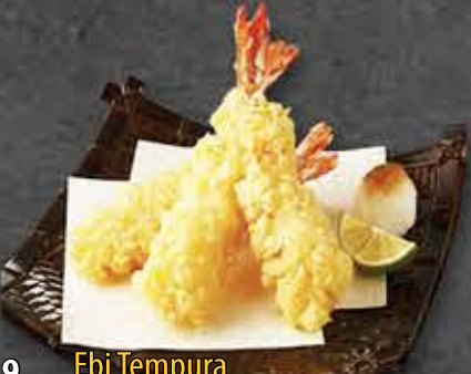
Ebi Tempura Deep Fried Prawns 3 pcs 7.9/ 5 pcs 12.9