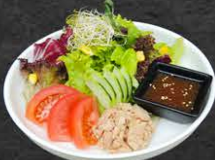
Shake Mayo Salad Salmon Mayo Salad 8.9