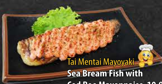
Tai Mentai Mayoyaki Sea Bream Fish with Cod Roe Mayonnaise 10.9