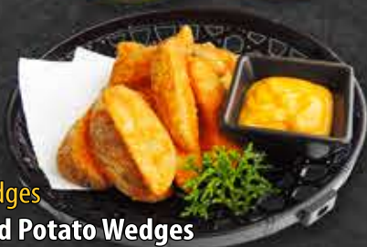
Potato Wedges Deep Fried Potato Wedges with Nacho Cheese 4.9