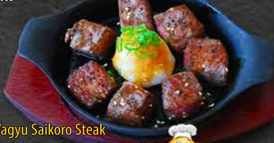
Wagyu Saikoro Steak Wagyu Beef Steak & Radish with Citrus Sauce 19.9