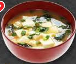
Miso Soup Bean Paste Soup with Seaweed & Tofu 2.9