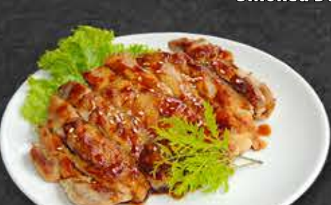
Chicken Teriyaki Grilled Chicken with Teriyaki Sauce 9.9