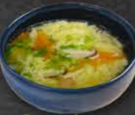
Tamago Soup Egg Soup with Vegetables 3.9