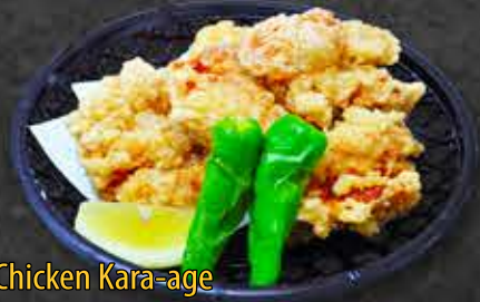
Chicken Kara-age Deep Fried Chicken 6.9 (with Salted Egg Yolk) 8.9