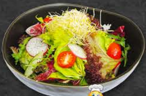
Yasai Salad Mixed Salad 6.9