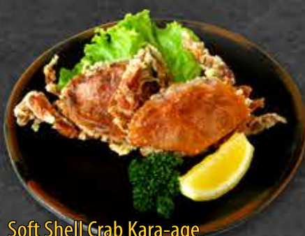
Soft Shell Crab Kara-age Deep Fried Soft Shell Crab 1 pc 8.9/ 2 pcs 16.9