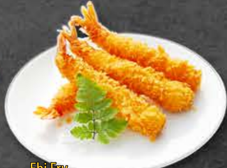
Ebi Fry Deep Fried Breaded Prawns 3 pcs 7.9/ 5 pcs 12.9