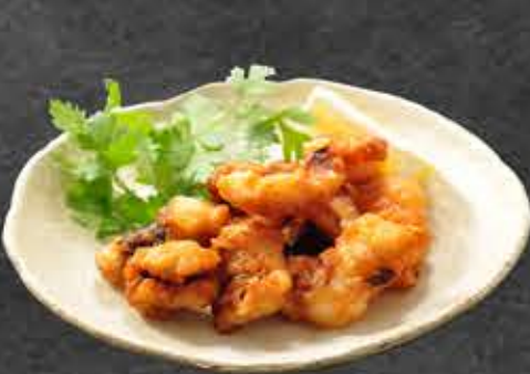
Tako Kara-age Deep Fried Octopus 6.9 (with Salted Egg Yolk) 8.9