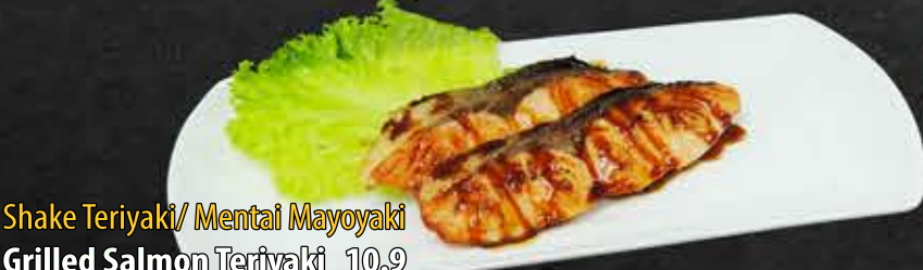
Shake Teriyaki/ Mentai Mayoyaki Grilled Salmon Teriyaki 10.9 Grilled Salmon Mentai 12.9